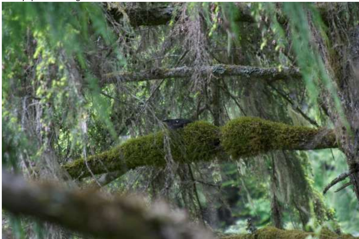
Figure 4b. Nest platform at 2005 Rica Canyon nest.