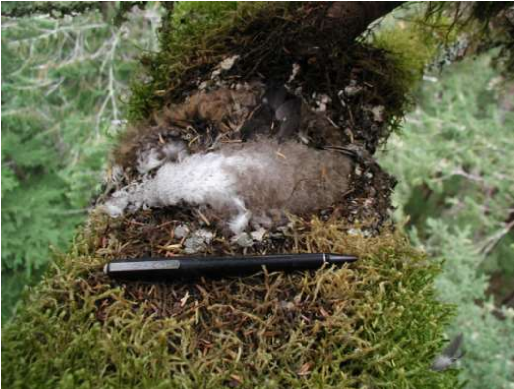
Figure 15b. 2008 North Fork Sol Duc tree nest with dead nestling removed from nest cup showing partial fecal ring.