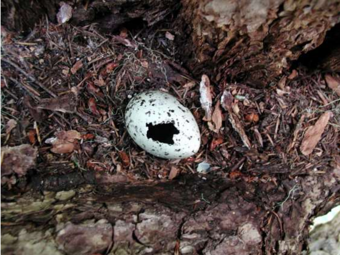
Figure 10b. 2007 Lillian River nest with egg in Douglas-fir.