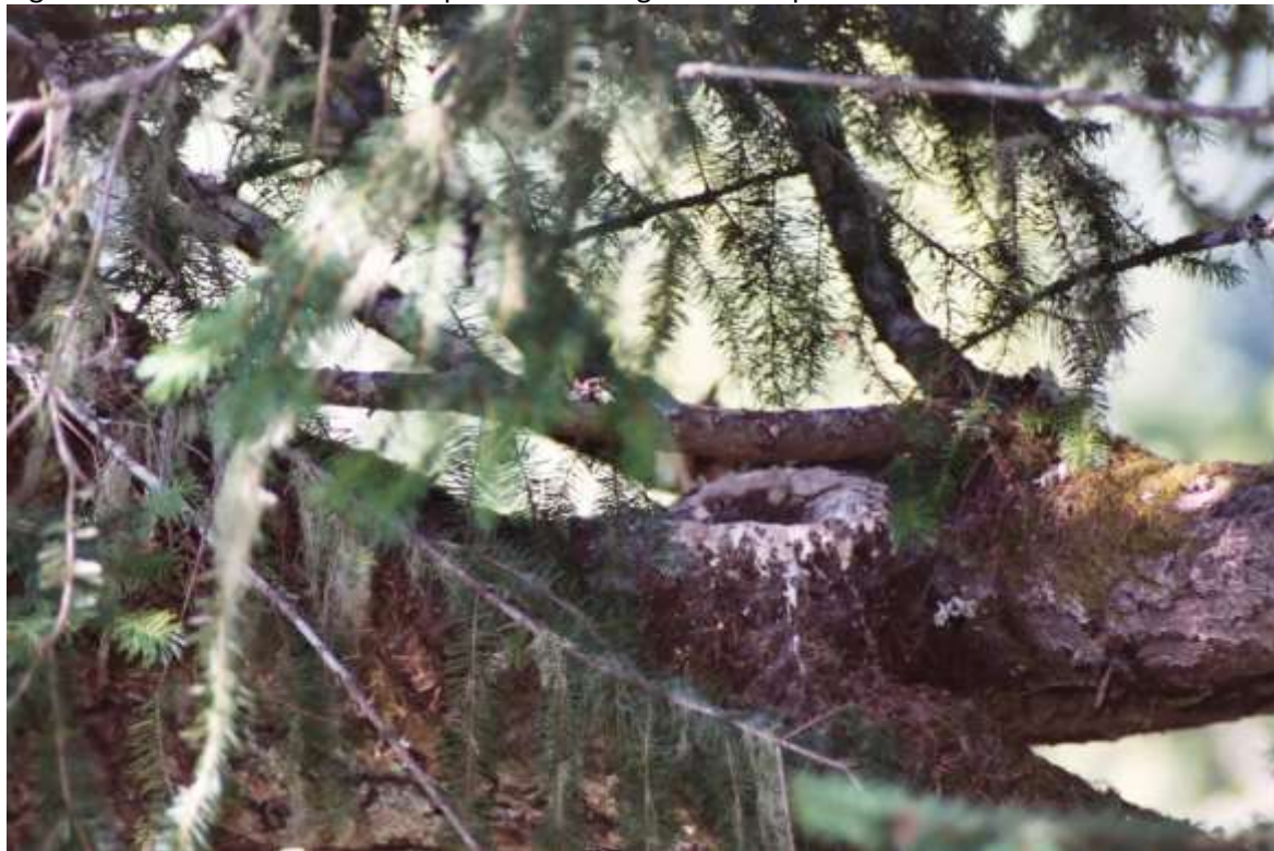
Figure 1a. 2004 Lake Mills nest cup with fecal ring. Nest was presumed successful based on fecal ring.

Appendix 3: Photos of 15 marbled murrelet nests monitored 2004-2008 in northwestern Washington and Southwestern British Columbia. Photos were taken during or after nesting season.