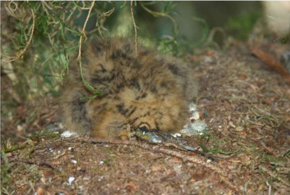
Figure 8b. 2005 South Fork Hoh chick dead in nest with compass for scale.