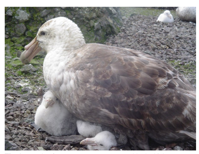
Fig. 1. Female of Macronectes giganteus and both chicks.

It has been suggested that parents might differentiate their offspring by their physical appearance (Miller & Emlen 1975). Although feeding sessions were not observed, the native chick and the adopted chick were raised successfully at first, but after the third week of adoption, we observed aggressive behaviors between the chicks,