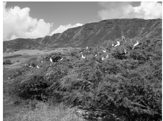
Fig. 2. Example of high-density nesting of Red-footed Boobies in the central portion of kiawe trees at the lower-elevation area of the nesting colony. High winds are hypothesized to have destroyed nests on outer branches.