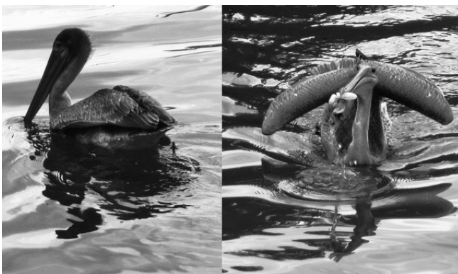
Fig. 2. Young Brown Pelican recorded at Trombetas River Biological Reserve, Oriximiná, state of Pará, Brazil, 25 January 2016.

In regard to the provenance of our sighting, one possibility is that this juvenile was the same one recorded earlier in Santarém by