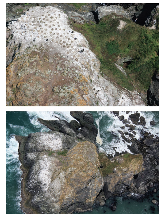
Fig. 2. Little River Rock on 28 May 2009 (top; showing deserted nests and human disturbance) and 05 June 2017 (bottom; after the colony moved to the lower west side of the rock).

From 1959 to 2017, breeding DCCO were documented at 13 coastal locations in the Humboldt Bay area, from Big Lagoon (41°10'00"N, 124°07'30"W) south to Sugarloaf Island at Cape Mendocino (40°26'20"N, 124°24'50"W), including colonies in Humboldt Bay (Fig. 1). This region is a subset of the Northern Coast-North Section of western North America DCCO status assessments (Carter et al. 1995, Adkins et al. 2014). All locations except Big Lagoon had been previously named and mapped (Sowls et al. 1980; Carter et al. 1992, 1996). At eight breeding colonies (Sea Gull Rock, Sea Lion Rock, White Rock, Pilot Rock, Trinidad Bay Rocks, Little River Rock, False Cape Rocks, and Sugarloaf Island), nests were built on the ground on sea stacks within 1 km of shore (Fig. 2). At Big Lagoon, cormorants nested in Sitka spruce Picea sitchensis. Four breeding colonies (Old Arcata Wharf, Arcata Bay Sand Islands [hereafter, Sand Island], Humboldt Bay Duck Blinds, and Teal Island) were on artificial habitats in Humboldt Bay (Figs. 3, 4). The northern and southern arms of Humboldt Bay are known as Arcata Bay and South Bay,