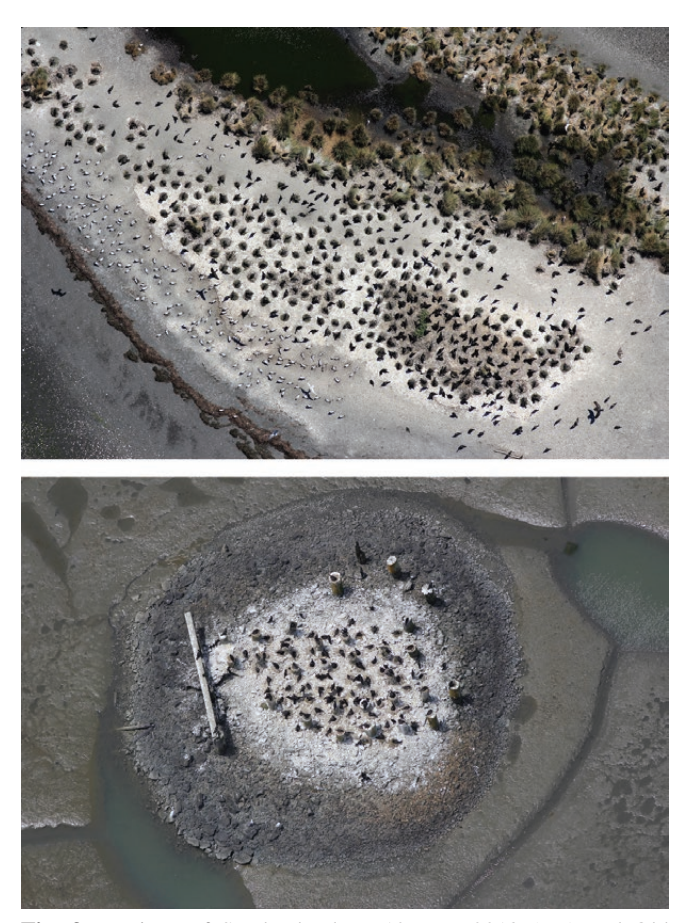
Fig. 3. Portions of Sand Island on 12 June 2013 (top) and Old Arcata Wharf on 05 June 2017 (bottom).

Data from limited local observations were gleaned from published literature, from egg records and field notes archived in museum collections, and through conversations with local biologists. Periodic broad-scale surveys of seabird colonies throughout the region were first conducted in 1969 and 1970. These included boat surveys, on-island surveys, and surveys from the adjacent mainland (Osborne 1972). Similar methods were used in 1979 and 1980 for the Catalog of California Seabird Colonies (Sowls et al. 1980), but aerial photographic surveys were also employed, though mainly for Common Murres Uria aalge and Brandt's Cormorants P. penicillatus . By the 1989–1991 update to the colony catalog (Carter et al. 1992), aerial photographic surveys of murre and cormorant colonies in California were more standardized, but a mixture of methods were still used for cormorant colonies in northern