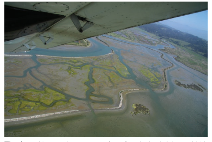
Fig. 4. Looking southeast at a portion of Teal Island, 05 June 2014. Cormorants nest on the narrow perimeter dike.

For each colony, we summed counts from multiple aerial photographs to determine whole-colony counts of nests. For the 1989-2004 period, slide images were projected onto large sheets of white paper and each cormorant nest, territorial site, and bird was marked; manual methods of image analysis software (Image-Pro®; Media Cybernetics, Rockville, MD, USA) were used for 2008, 2014, and 2017. Photographs of most colonies in other years since 2004 were not analyzed and remain archived. Big Lagoon and Sand Island counts for 2015 and 2016 are presented here because these are sample colonies for Western-population monitoring (USFWS 2017), but these counts were not used in analyses because data by colony complex in these years were incomplete. Nests were categorized by their stage of development, including poorly built (no eggs laid yet), well-built nests (with an incubating adult), nests with chicks evident, empty nests (well-built with standing adult attending, no eggs or chicks present), and abandoned nests. Territorial sites included locations with little or no nesting material