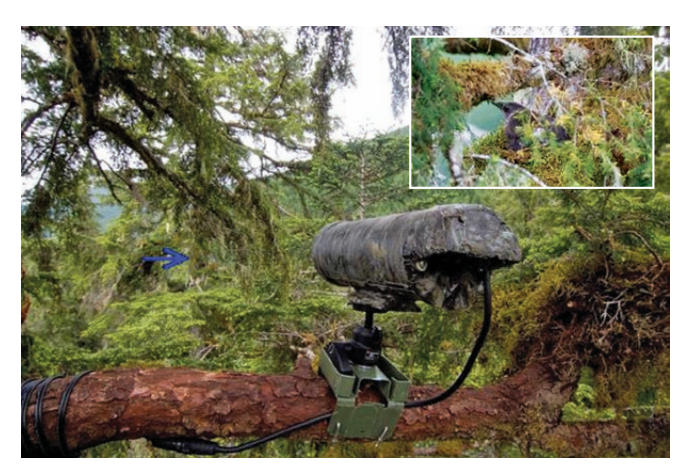
Fig. 1. Photo showing placement of a zoom lens relative to the Hemmingsen Creek Marbled Murrelet nest in 2006 (nest is indicated with arrow), on Vancouver Island, British Columbia. Zoom lenses were typically placed in nearby trees on limbs 30–50 m from the nest. A ~50-m cable cable extended from the lens to the ground. Deep-cycle batteries (for powering the camera) and a digital video recorder (for recording and storing video files) were placed on the ground below the camera tree. Thus, when we visited the nest to replace batteries we did not have to climb the camera tree. Inset photo in upper right shows the Hemmingsen Creek Marbled Murrelet incubating an egg on the nest.

We visited all nests after the nesting season to view nest contents. For nests that were not video monitored, we considered nests