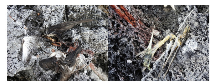
Fig. 6. (A) The remains of Bridled Terns and (B) fish, likely eaten by a White-bellied Sea Eagle at Pulau Tokong Burung Besar.

This study presents the first update on seabirds, their colonies, and aggregation sites in the northern section of the Seribuat Archipelago since the historic surveys conducted nearly 70 years ago (Gibson-Hill 1950). Several sites were found to be important hotspots of seabird biodiversity in the region, both in terms of species richness and abundance. Some of these islands are of regional importance as seabird breeding sites (i.e., the Tokong Burung Group) and should be proposed as new Important Bird Areas (IBAs). Surrounding waters should be designated as Marine Protected Areas, which can