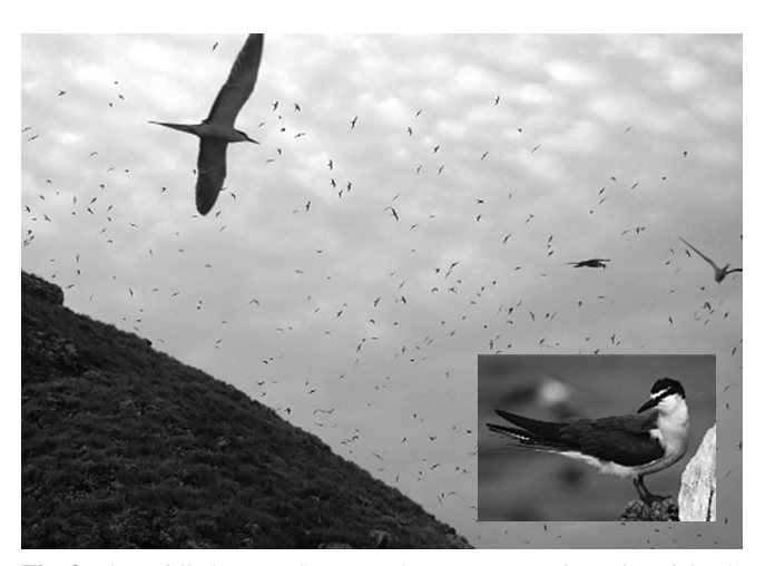
Fig. 3 . The Bridled Tern colony at Tokong Burung. These three islands host one of the largest colonies of this species in southeast Asia.

or under grass and shrubs. Most eggs in a typical colony are well hidden (Hamza et al. 2016a), but similar to Black-naped Terns, the population has suffered from several decades of egg harvesting by locals on many islands. In the present survey, eggs were found that were still being incubated in early September at Pulau Tokong Burung (Fig. 3). Egg harvesting at this site is still practiced; local fisherman from Pulau Tioman visit the site in May, setting fire to the grassy cover of some of the three islands. This provides barren area for incoming breeding birds, and forces the terns to lay freshly synchronized clutches, which are later harvested (Grismer et al. 2006). One fisherman informed us that they can collect up to 6000 eggs in a single day. This practice is conducted once per year, early enough that Bridled Terns can replace clutches. The long-term effects of this practice on population genetic structure requires further investigation. Replacement laying appears to be an alternative survival strategy for these birds, as indicated by the presence of active nests in September, which falls at the end of the breeding season. However, breeding success and juvenile survival rates from replacement clutches are lower in other species, such as the Sooty Tern Onychoprion fuscata (Feare 1976). The estimated population size of the Bridled Tern in Pulau Tokong Burung ranges from 12000 to 15000 individuals, followed by Tokong Bahara with