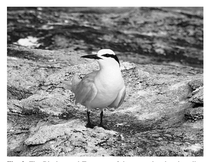
Fig. 2. The Black-naped Tern, one of the most abundant breeding tern species along the east coast islands of Peninsular Malaysia.

The Bridled Tern is a resident breeder of the study area (Jeyarajasingam & Pearson 2012) and tends to occupy oceanic environments and isolated islands with cliffs and moderate vegetation cover (Hamza et al. 2016a, 2016b). It breeds from May to August, laying one to two eggs on bare rocks, in cliff crevices,