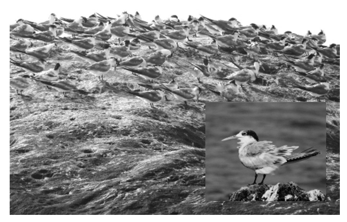
Fig. 4. Aggregation of roosting adult and juvenile Greater Crested Tern on Pulau Labas.

5000 to 6000 individuals (Table 2). Pulau Tokong Burung could be of sub-regional importance, as it hosts the largest colony of Bridled Tern in Peninsular Malaysian waters. Although the species is considered a resident breeder (Jeyarajasingam & Pearson 2012), its post-breeding movements are not well known, and many locals have confirmed that there are no Bridled Terns on the three islands (or on nearby islands) during the monsoon season from November to late February. It is possible that Bridled Terns migrate south to Indonesia, or even to Australia, similar to the western Pacific/southeast Asian populations of Little Tern Sternula albifrons sinensis . Tracking studies will be important to reveal the post-breeding movements of these birds.