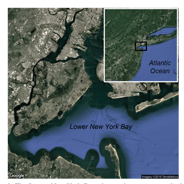
Fig. 1. The Lower New York Bay, the southernmost waterbody in the New York–New Jersey Harbor Estuary.

The Lower New York Bay (hereafter "lower bay") is the southernmost waterbody within the heavily urbanized New York-New Jersey Harbor Estuary (Fig. 1). The lower bay is a near-marine environment that feeds directly into the Atlantic Ocean between the Rockaway and Sandy Hook peninsulas (Waldman 2013). Winter salinities range from 18.4 to 30.9 parts per thousand, with the lowest salinities recorded near the shores of Staten Island and Brooklyn, New York, and along the New Jersey shoreline (Cerrato et al. 1989). The highest salinities are recorded off the Rockaway Peninsula, where the bay meets the Atlantic Ocean (Cerrato et al. 1989). Most of the lower bay does not exceed 10 m in depth, although the Ambrose Channel, which is the only major shipping lane into the Port of New York and New Jersey, has a dredged depth of ~50 ft (~15 m) (USACE 2012). Throughout the lower bay, bivalve mollusks like blue mussels Mytilus edulis and northern quahogs Mercenaria mercenaria are abundant, with northern quahogs reaching some of their highest local concentrations in the southern part of the lower bay (within the Raritan Bay; MacKenzie 1997).