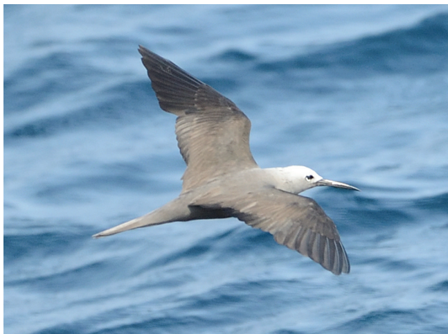
Fig. 1. Lesser Noddy Anous tenuirostris, Haa Alifu Atoll, Maldives, 14 Feb 2023.