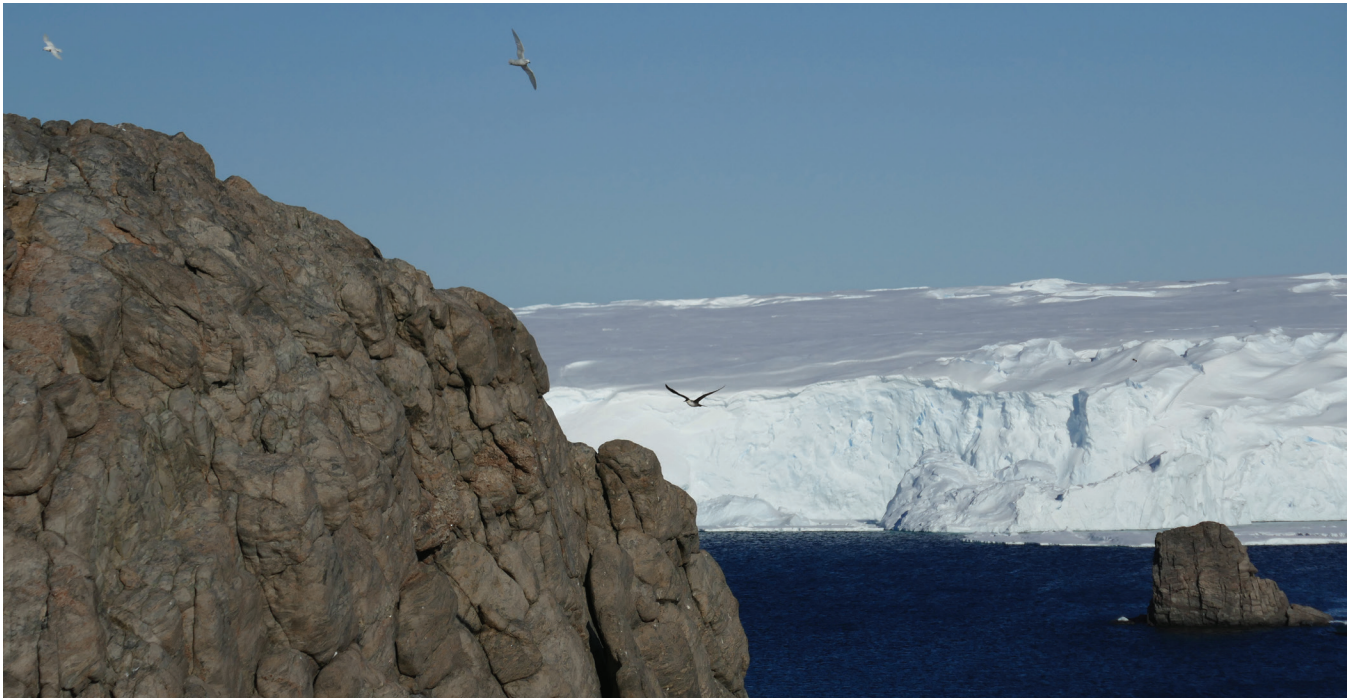
Fig. 2. Long-tailed Skua Stercorarius longicaudus (centre of the picture) observed in Terre Adélie, off the coast of Antarctica, above Mont Joli (left). The Astrolabe glacier (background) and Lamarck Island's characteristic Donjon (right) are also visible. Several Snow Petrels Pagodroma nivea are visible on the top left.